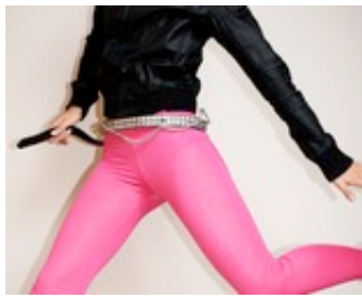
Cotton pink legging... MajoReyStore $30.00