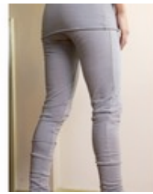
Sandmaiden Wool Kni... sandmaiden $99.00