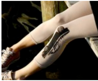
Vintage Car Legging... branchhandmade $19.00