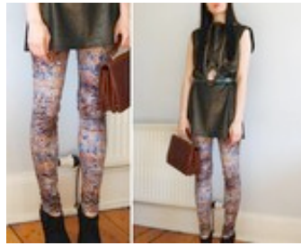
Luxe Collection Leg... iheartnorwegian... $55.00